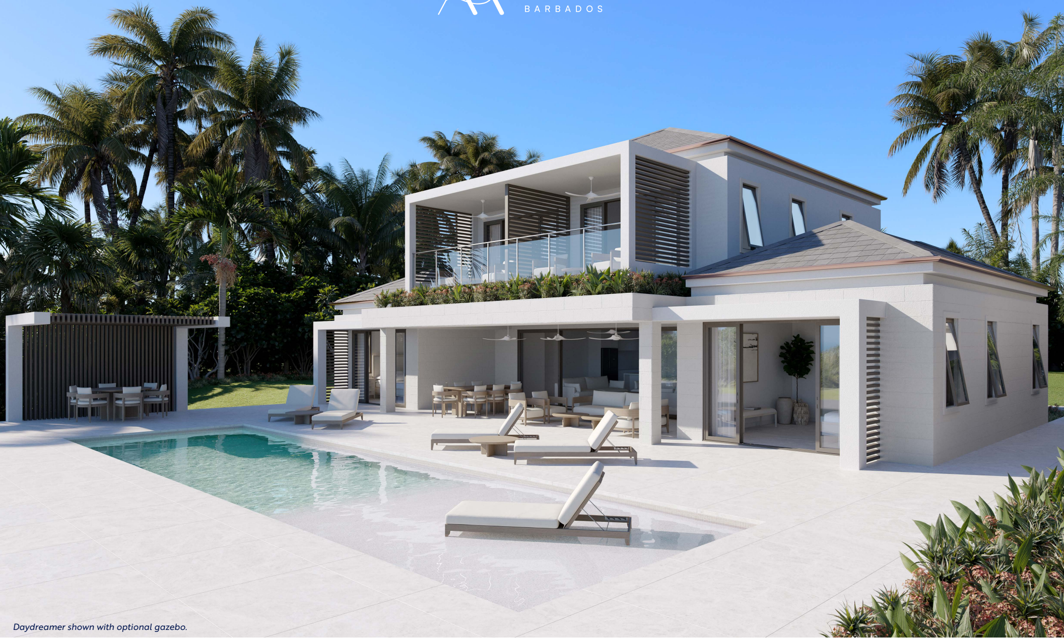
Daydreamer shown with optional gazebo.